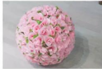
Step 2: Merge