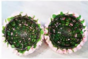
Step 1: Separate the two halves