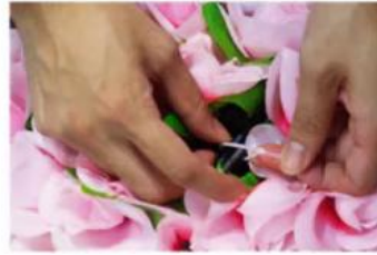
Step 3: Recommended reinforcement with zip ties