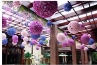
Step 4: Installation completed